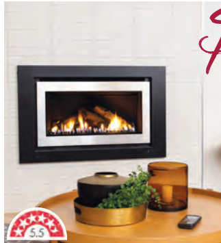
950 Natural Gas Fire Place

Provide a Rinnai 950 - K952 Natural Gas Fireplace to external wall of the lounge room & approx. 150mm from Slab level. Consist of additional framed and Plasterboard lined wall approx. 1800mm x 600mm, Horizontal flue with a choice of black on black fascia or stainless steel on black fascia and Logset or Ceramic Stones.