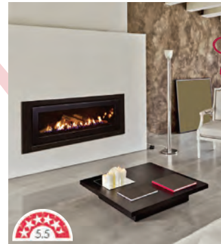
1250 Natural Gas Fire Place

With a host of extra features including a safety mesh guard and easy-to-use remote with temperature display, you'll experience peace of mind and comfort during those chilly months. Settle in beside a flickering flame this winter with the Rinnai 950 gas fire.